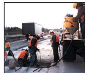
Highway Dowel Rods