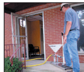
Filling Door Frame