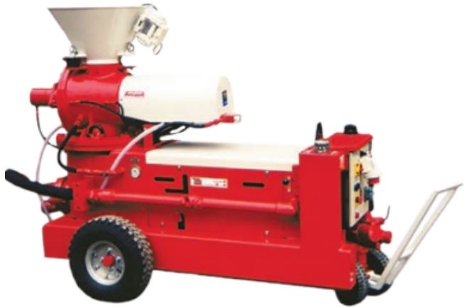
TSN BUNKER STATION

The Clever & Co machines are used in some of the most demanding and adverse conditions, in refractory application, building refurbishment, tunnel construction or mining. Made in Germany.